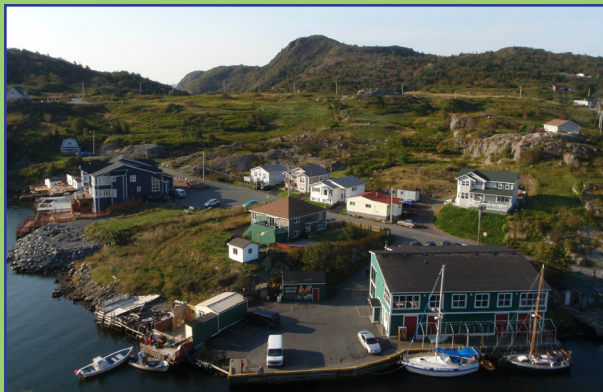
Quidi Vidi Brewery St. John's, NL

Ticket includes Brewery Tour, Dinner, Gratuity and Entertainment